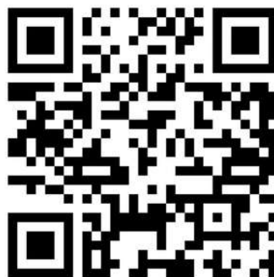
Dream Compassion's interview