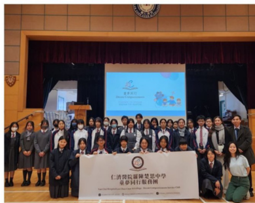
Dream Compassioners Service Club@LCCSC