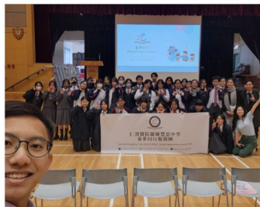
Dream Compassioners Service Club@LCCSC