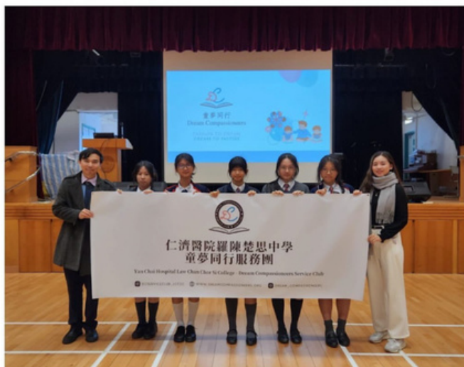
Dream Compassioners Service Club@LCCSC Committee Members