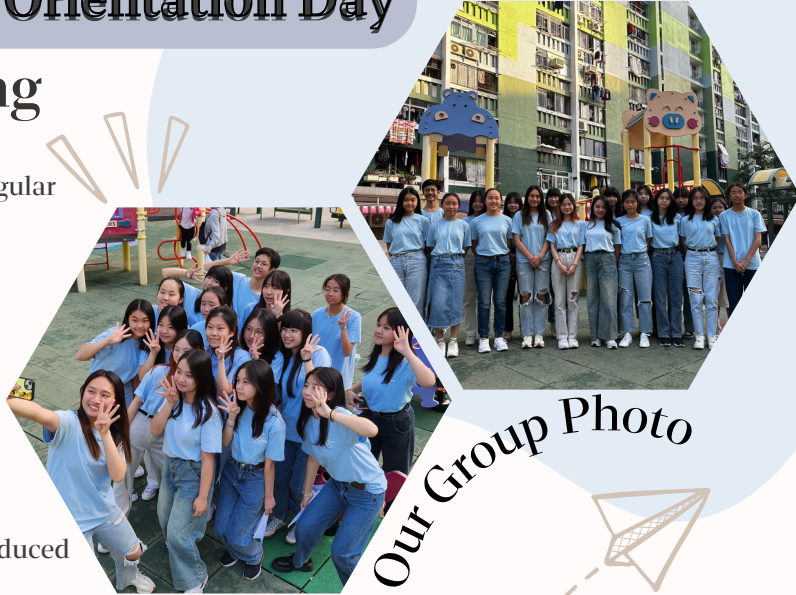
Our Group Photo

The 4th Executive Committee Orientation Day and the first regular meeting were successfully held this month, providing a great platform for the new committee members to get to know each other and strengthen their bonding. We were honoured to have the presence and support of the Management Board members, who provided us with encouragement and support that greatly inspired us. On that day, we got acquainted with each other, took the group photo for this year, and briefly introduced the DC activities. The atmosphere was lively and energetic! We will strive to do our best in the coming year to serve the students. We hope that the 4th Executive Committee will work hard to promote the service work and contribute their best efforts to serve the students.